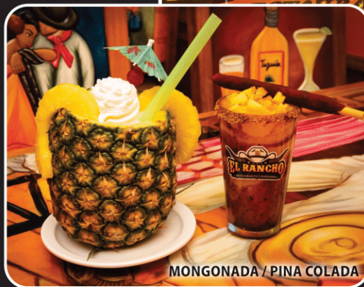
MONGONADA / PINA COLADA